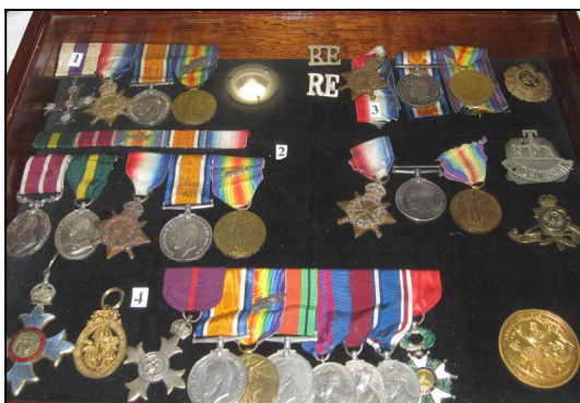
Some of the medals and artefacts on display at the event

The latest event involving the Pals Project was at Langtree Park, the home of St Helens Rugby League Club on Sunday 9th September as part of the Heritage Festival Weekend. This event was a huge success with a great number of St Helens folk bringing their stories, documents and memorabilia to add substance and humanity to help record the effort and sacrifice ordinary people made in our country's hour of need.